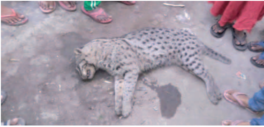
Fig. 1. An adult fishing cat roadkill in Doperia, Khardah, North 24 Parganas, 22 January 2020.

of deaths of fishing cats from all districts of West Bengal and identify the major causes of death.