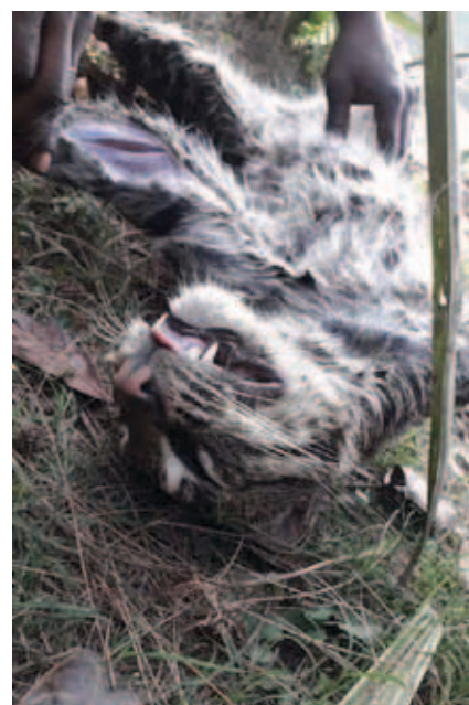
Fig. 3. A fishing cat that got electrocuted, was subsequently skinned and its meat consumed by locals in Shyampur block, Howrah.