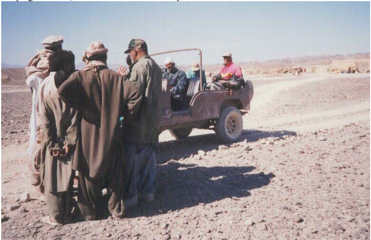
Interviews along the Pakistan/Iran border.

We have not seen any water points either. We have encountered a large number of pick-up trucks travelling to and from the Iranian border. All of them are fully loaded and seem to be carrying foodstuff, fuel and other items of daily use.