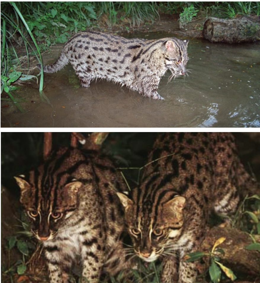
Fig. 1. Fishing cats stalking prey (top, photo N. Buck; bottom, photo Art Wolfe).

Fishing cats are strongly associated with wetlands. Although they are widely distributed through a variety of habitat types, their occurrence tends to be highly localized (Nowell & Jackson 1996, IUCN 2010). Across their range, fishing cats occur in coastal and inland wetlands, near rivers and streams, in marsh areas, reed beds, tidal creeks and mangrove forests. They are found close to the fringes of dense vegetation, including evergreen and tropical dry forest, scrubs, and tall grass (Nowell & Jackson 1996, IUCN 2010). In Sri Lanka and Thailand, fishing cats can also be found in degraded habitats intensively used by humans (Cutter & Cutter 2009, IUCN 2010). They have been observed at elevations up to 1,525 m in the Indian Himalayas (Nowell & Jackson 1996).