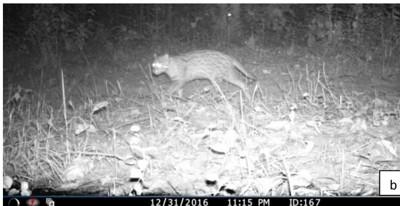
SOM F1. Camera trap photograph of fishing cat (2016-2017) a) right and b) left flank.