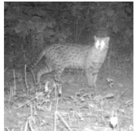
Fig. 2. Camera trap photograph of fishing cat (2016–2017;).